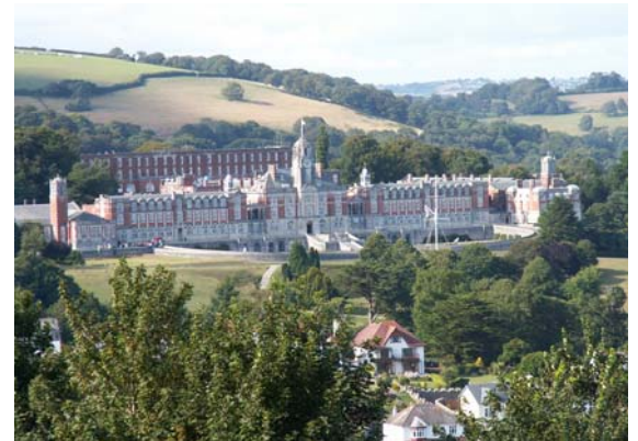
Below: Britannia Royal Naval College

Neither the Dart Valley Railway Plc nor the Churston Station Volunteer Group can accept any responsibility for any loss, damage or injury howsoever caused, nor responsibility for any delay, caused to or by any person following this suggested walk.